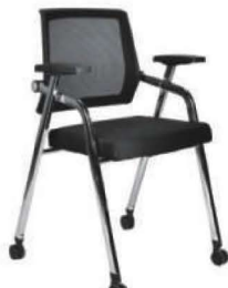
WITH WHEEL WITHOUT PAD