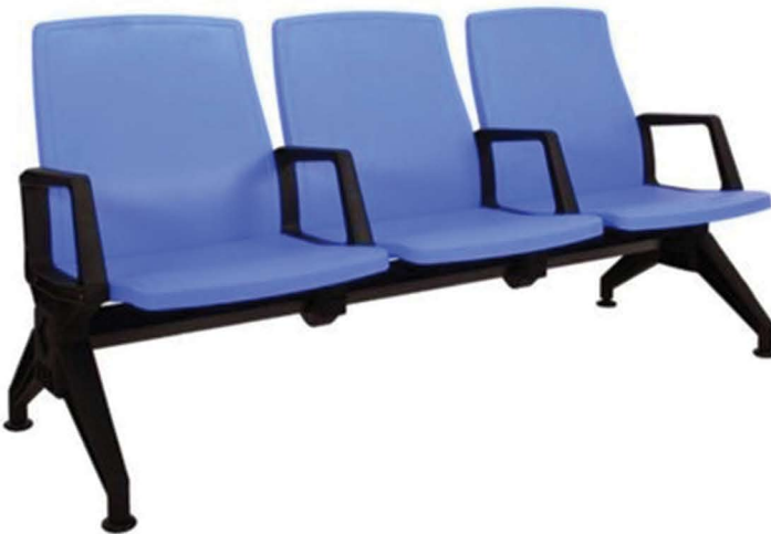
VIVA 1, 2, 3, 4, 5, 6