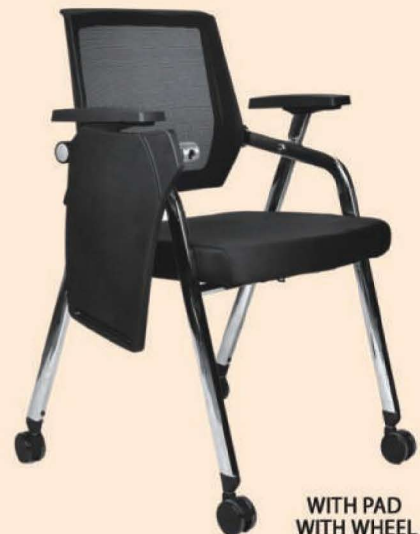
WITH PAD WITH WHEEL