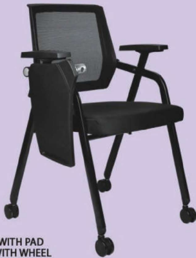
WITH PAD WITH WHEEL