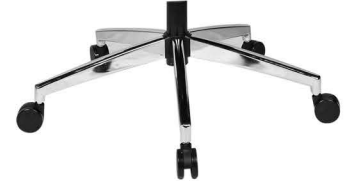
INDIGO CHROME BASE