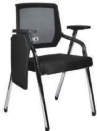
WITH PAD WITHOUT WHEEL

FLIP BACKREST IS MADE OF PP UPHOLESTED WITH MESH. BACKREST IS CONNECTED TO FRAME WITH HELP OF CONNECTOR'S MADE OF NYLON. METAL FRAME IS FOLDABLE & AVAILABLE IN CHROME FINISH. ARM PAD IS ADJUSTABLE ( FRONT & BACK ) SEAT CUSHION ALSO AVAILABLE WITH WRITING PAD + WHEEL