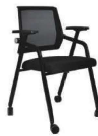
WITH WHEEL WITHOUT PAD