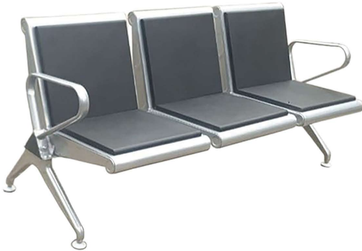
METRO SOFA WITH PU CUSHIONS 1, 2, 3, 4, 5