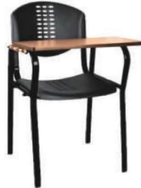
GAAMA WITH FULL- WRITING PAD