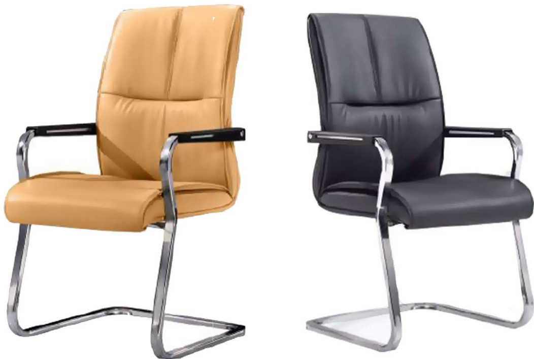
D 004 VC