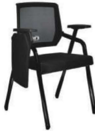
WITH PAD WITHOUT WHEEL

FLIP BACKREST IS MADE OF PP UPHOLESTED WITH MESH. BACKREST IS CONNECTED TO FRAME WITH HELP OF CONNECTOR'S MADE OF NYLON. METAL FRAME IS FOLDABLE & AVAILABLE IN POWDER COATING. ARM PAD IS ADJUSTABLE ( FRONT & BACK ) SEAT CUSHION ALSO AVAILABLE WITH WRITING PAD + WHEEL