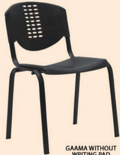
GAAMA WITHOUT WRITING PAD