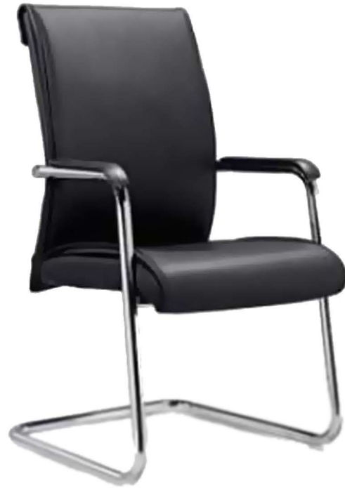
8024 B / 8024 D