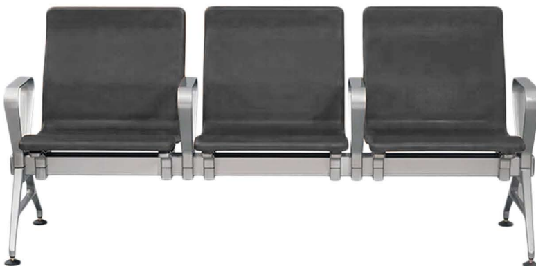
JUPITER AWE-PU SEATER 1, 2, 3, 4, 5