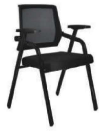
WITHOUT PAD WITHOUT WHEEL