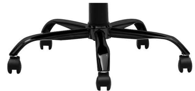
POWDER COATED METAL BASE