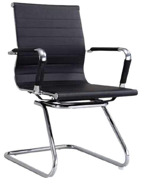
SLEEK HB / MB / VC