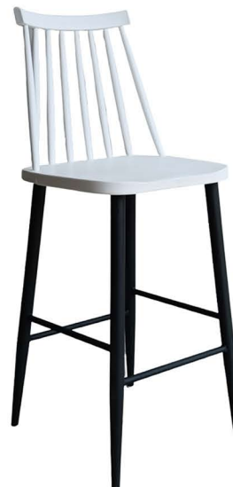
BUNNY COUNTER ECO