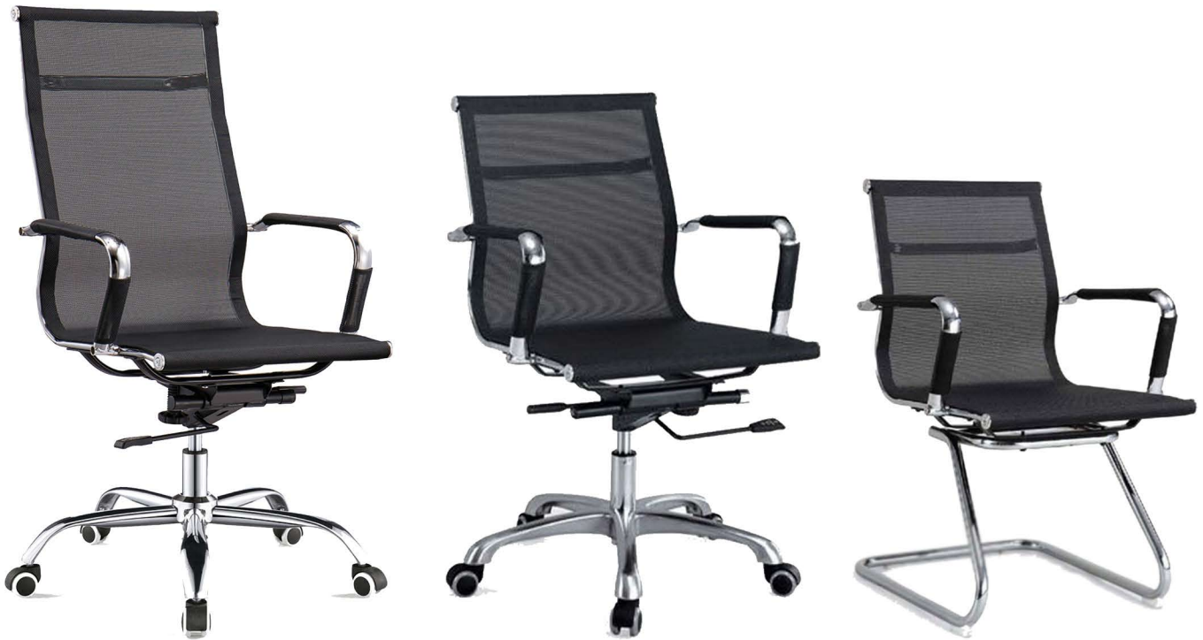
SLEEK NETTED HB / MB / VC