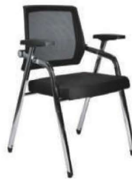
WITHOUT PAD WITHOUT WHEEL