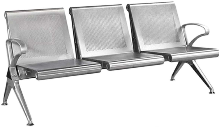
METRO SOFA 1, 2, 3, 4, 5