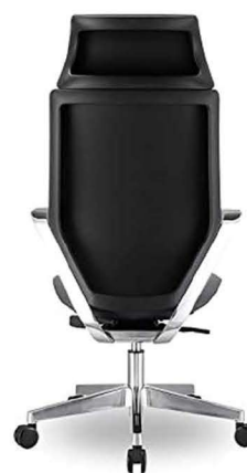
HYBA PU CUSHION