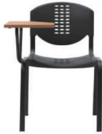
GAAMA WITH HALF - WRITING PAD